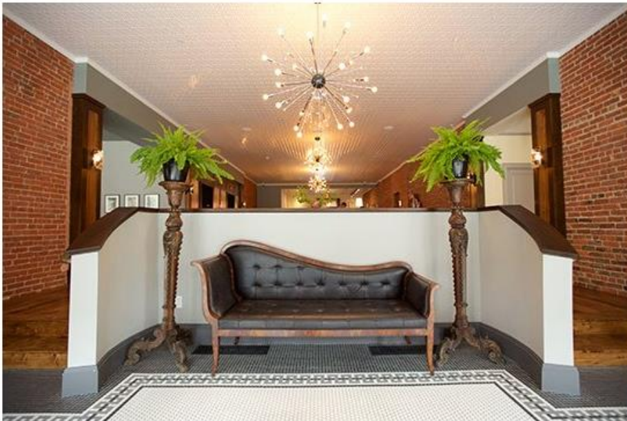
Entrance to the hotel lobby.