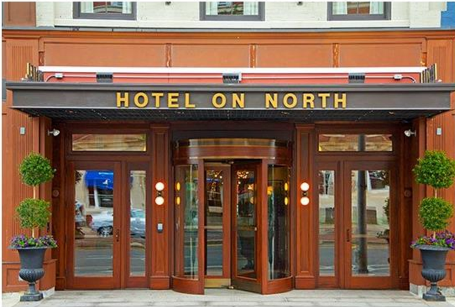
The entrance to Hotel on North in Pittsfield, Massachusetts.

Located at the center of the Berkshires in western Massachusetts, the city of Pittsfield has long seemed like an ideal hub for exploring the area's natural beauty and cultural attractions. To the north is the Massachusetts Museum of Contemporary Art (MASS MoCA), with its current exhibition by artist Clifford Ross, and the Clark Art Institute, recently expanded by architects Tadao Ando and Annabelle Selldorf. To the south are Tanglewood, summer home of the Boston Symphony Orchestra, and the Mount, Edith Wharton's former residence.