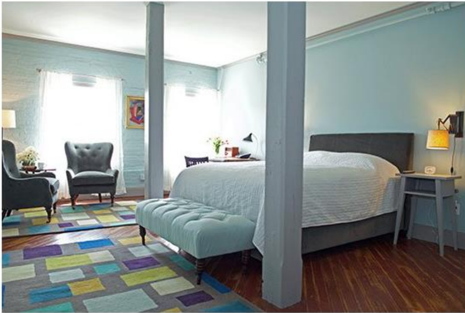
Hotel on North bedroom.

Then, it made every room unique with finds such as cabinets, tables, and mirrors from local vintage stores. "I went to a lot of auctions, and consignment, antiques, and junk shops to find things," says Fitzpatrick. "I like to think that guests coming to stay at the hotel live with some pieces that belonged to area families generations ago."