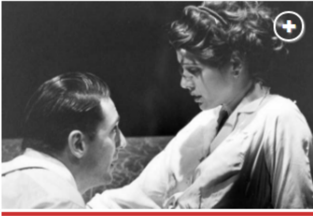
Marisa Tomei (right) heads back to The Williamstown Theatre Festival this season.