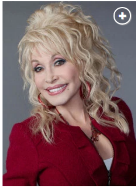
Country music legend Dolly Parton makes her debut at Tanglewood on June 17.