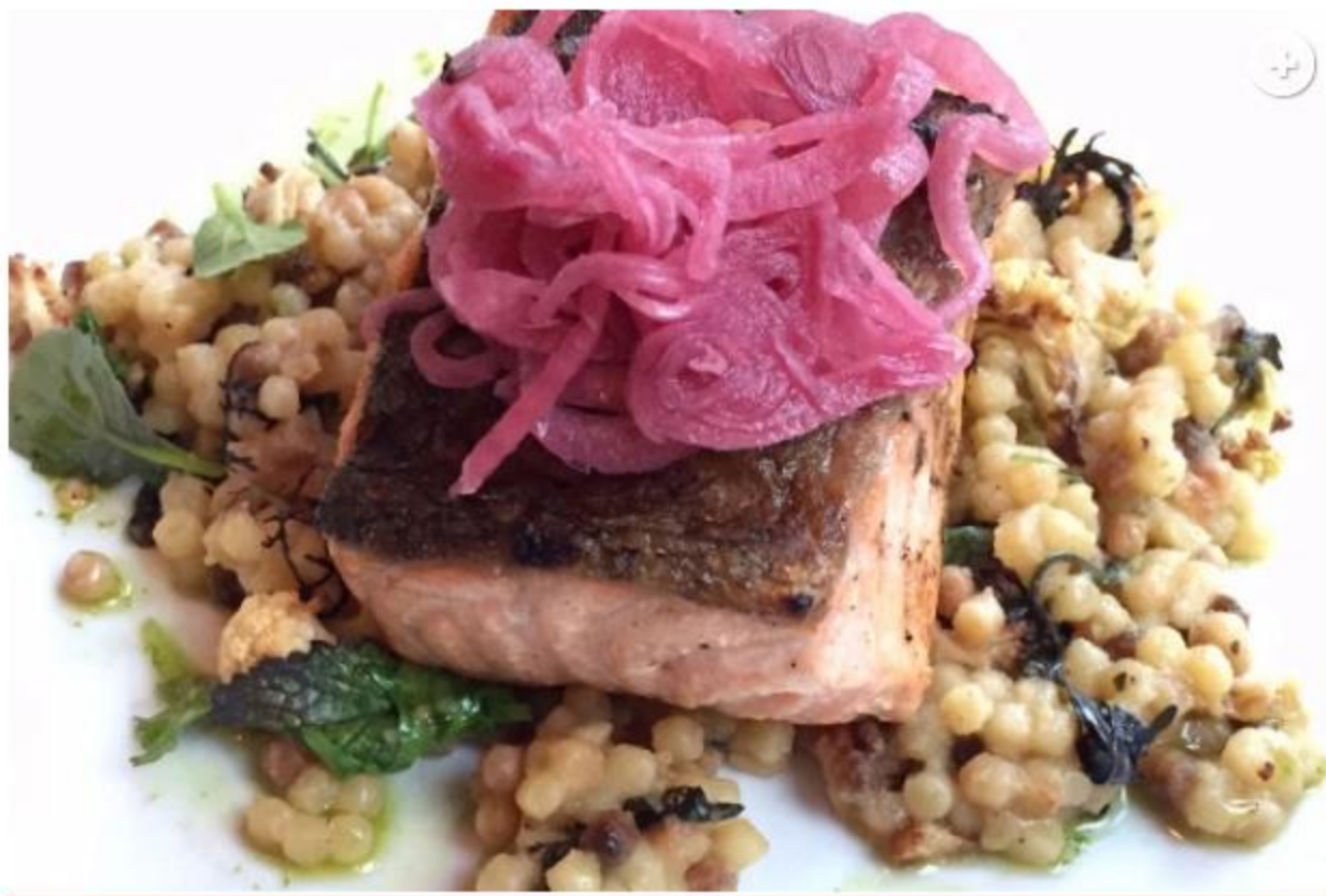
A colorful salmon dish at Eat on North.

locally sourced Eat on North — run by the folks behind Stockbridge's Red Lion Inn — serves sparkling oysters, duck in cherry sauce and a salmon dish as prettily composed as an Old Master painting.